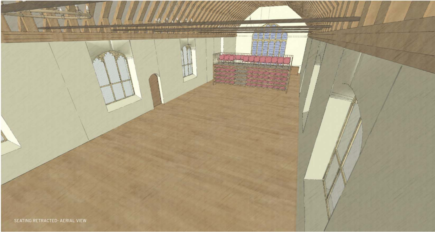
SEATING RETRACTED- AERIAL VIEW