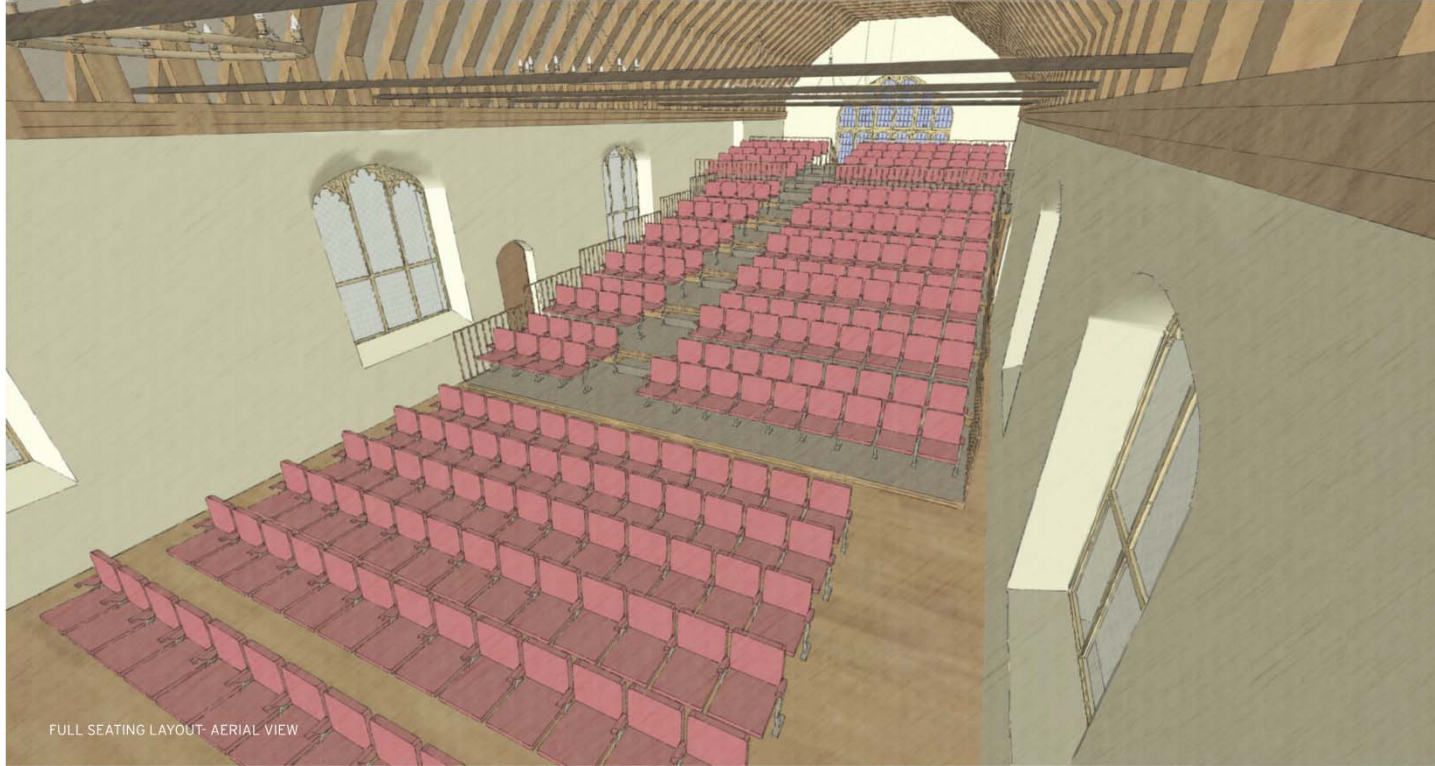
FULL SEATING LAYOUT- AERIAL VIEW