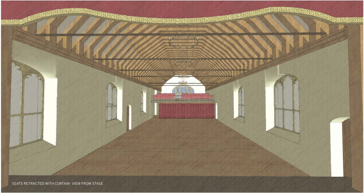
SEATS RETRACTED WITH CURTAIN - VIEW FROM STAGE