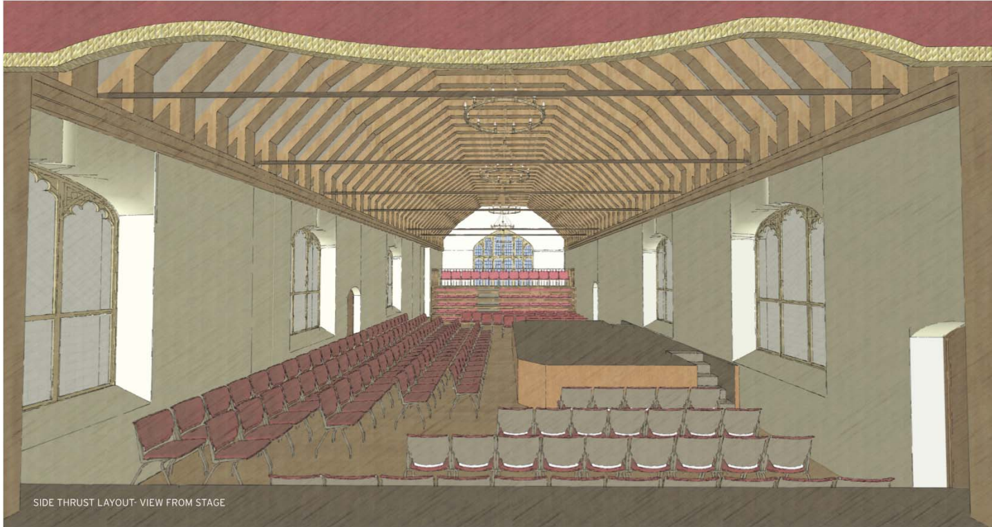
SIDE THRUST LAYOUT- VIEW FROM STAGE