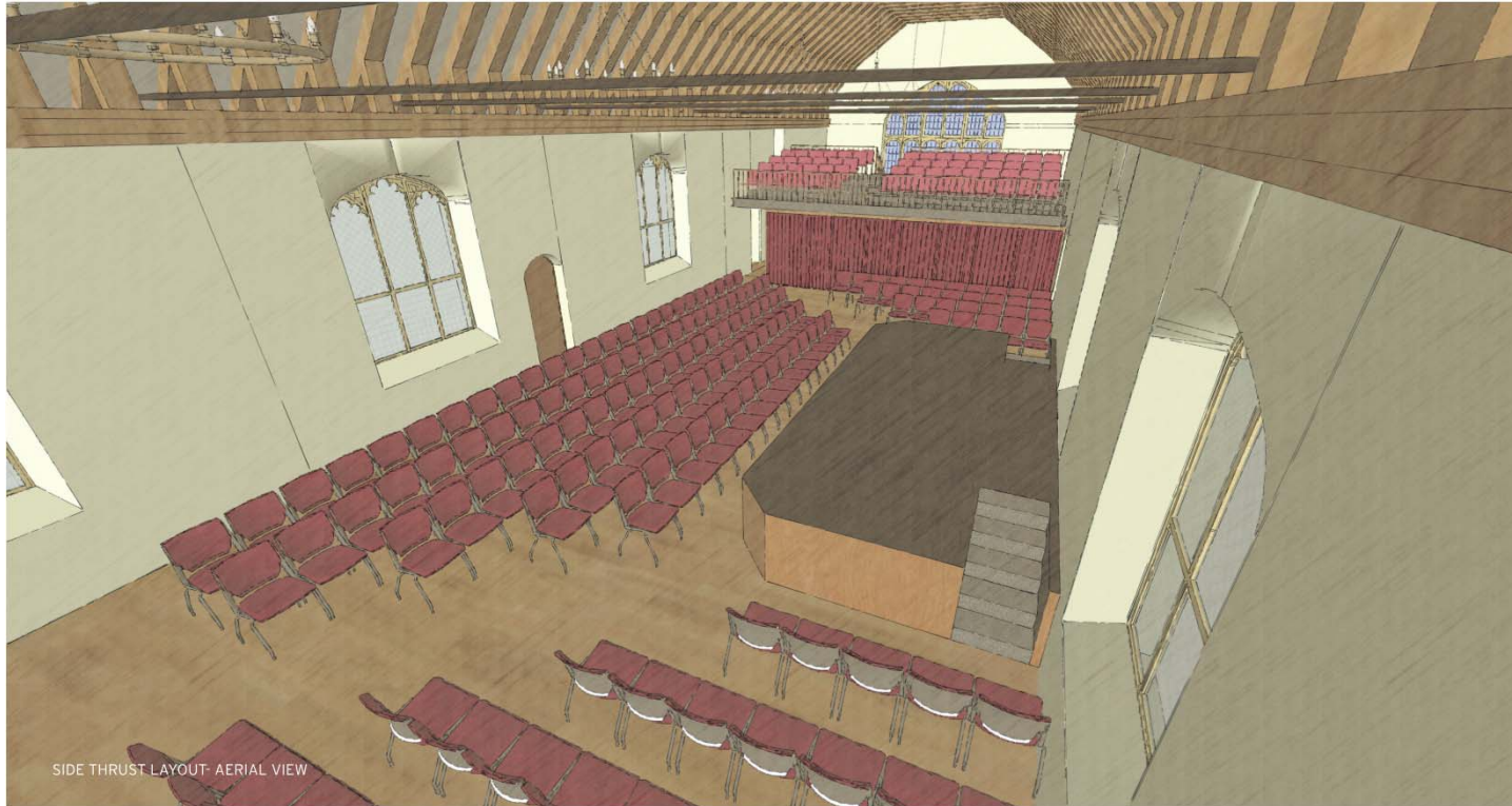
SIDE THRUST LAYOUT- AERIAL VIEW