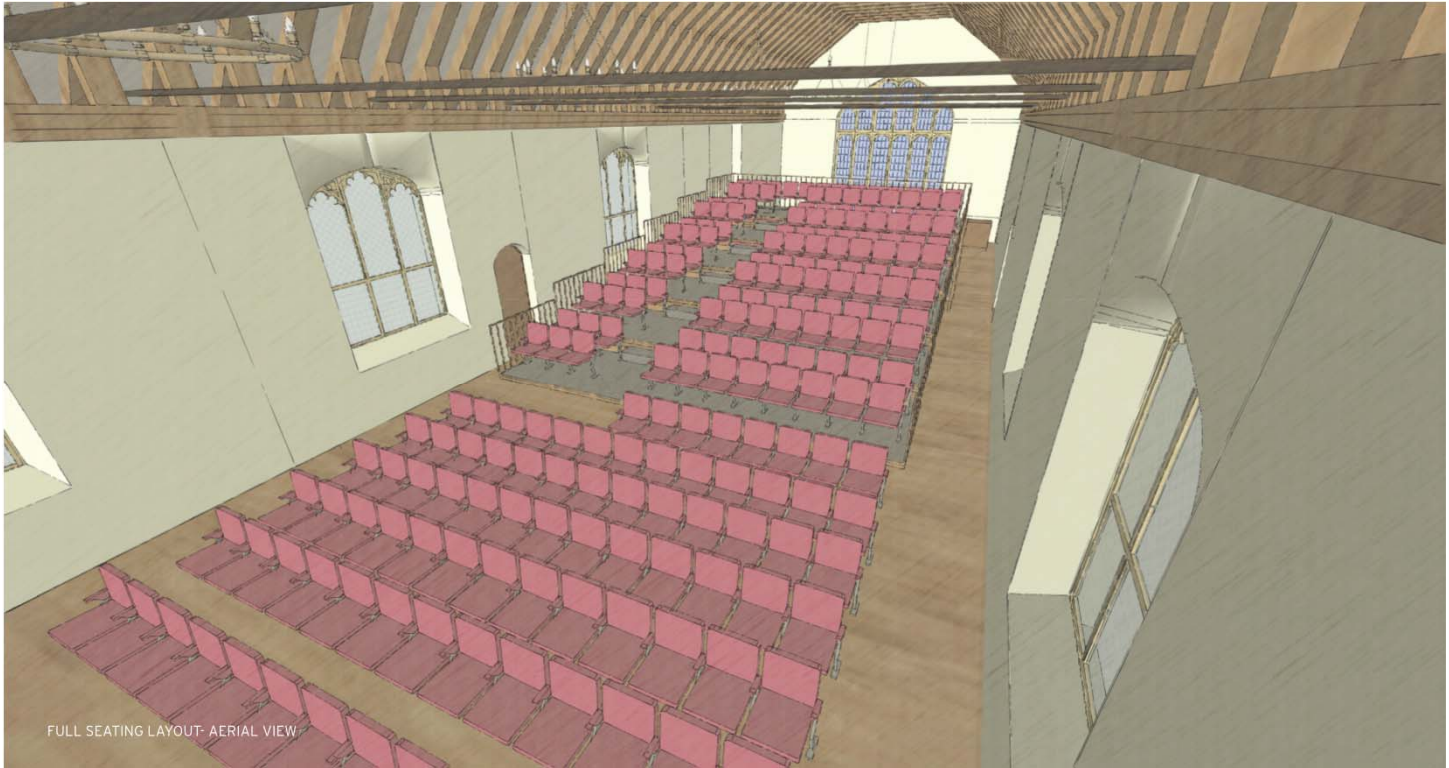
FULL SEATING LAYOUT- AERIAL VIEW